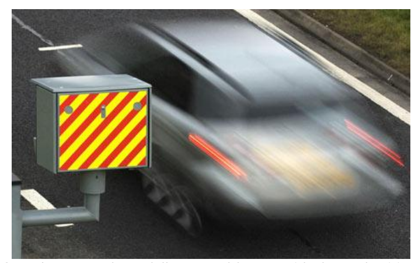
Speed cameras have fallen out of favour with the authorities.

The government has cut thirty-eight million pounds from this year's road safety budget and ended central funding for speed cameras, meaning that many local authorities switch off the cameras because they cannot afford to operate them.