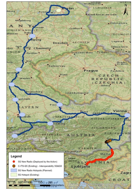
First demo region in DE/AT/SI - Additional regions to be added