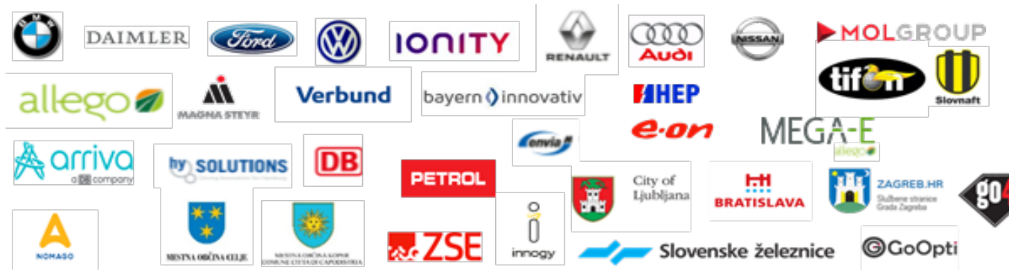
Project partners currently supported by Ardan in EU projects